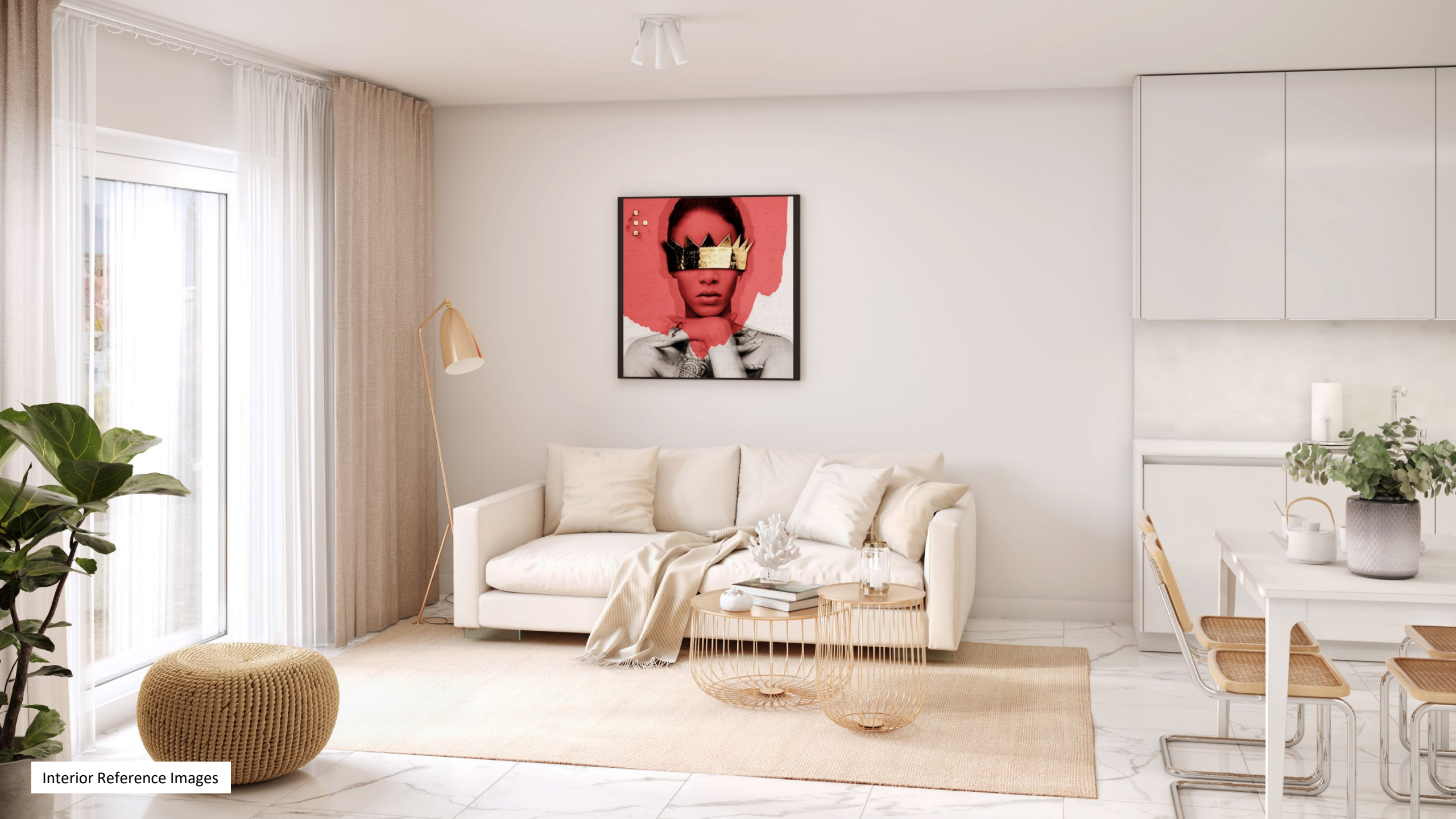
Interior Reference Images