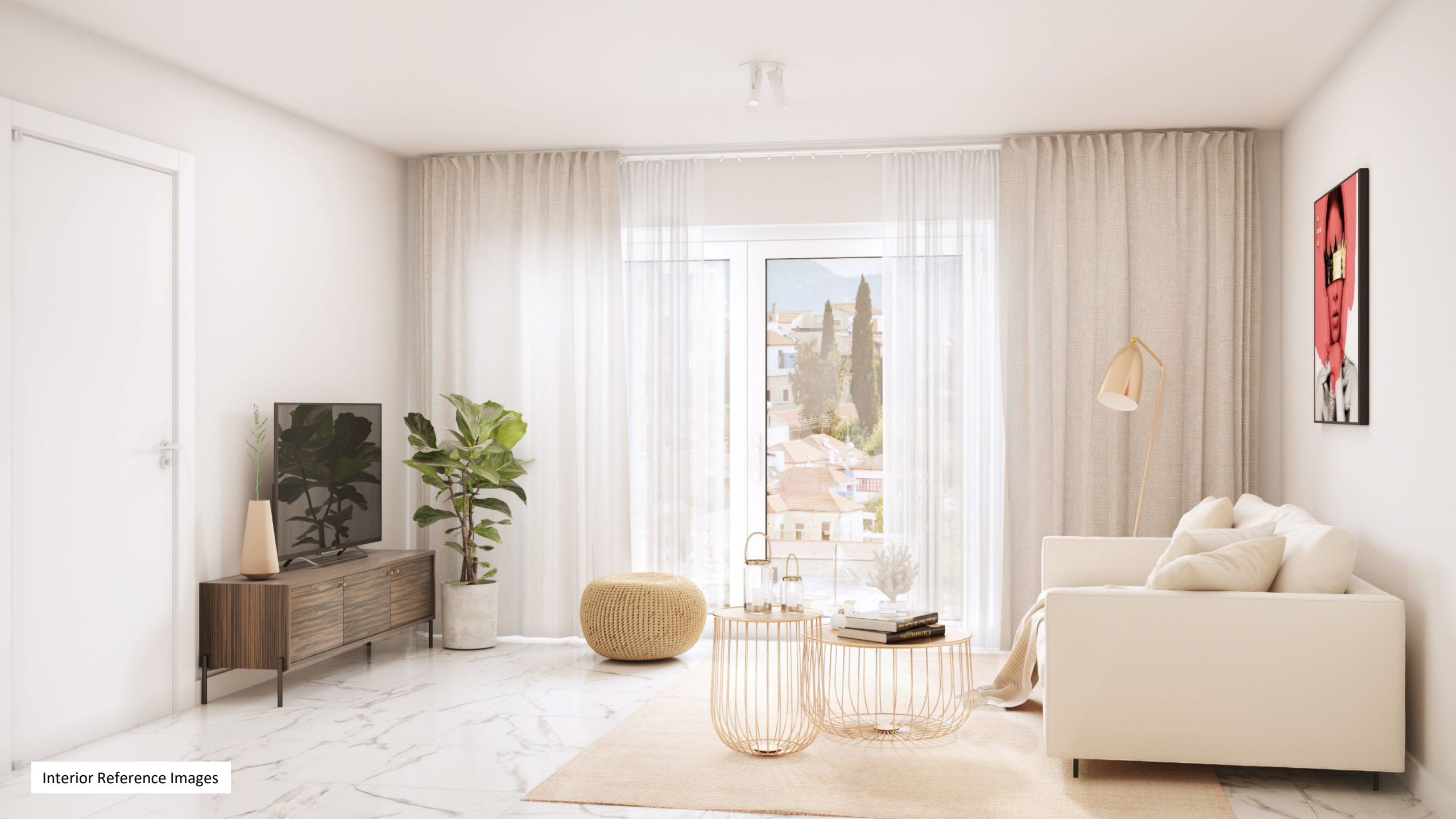
Interior Reference Images