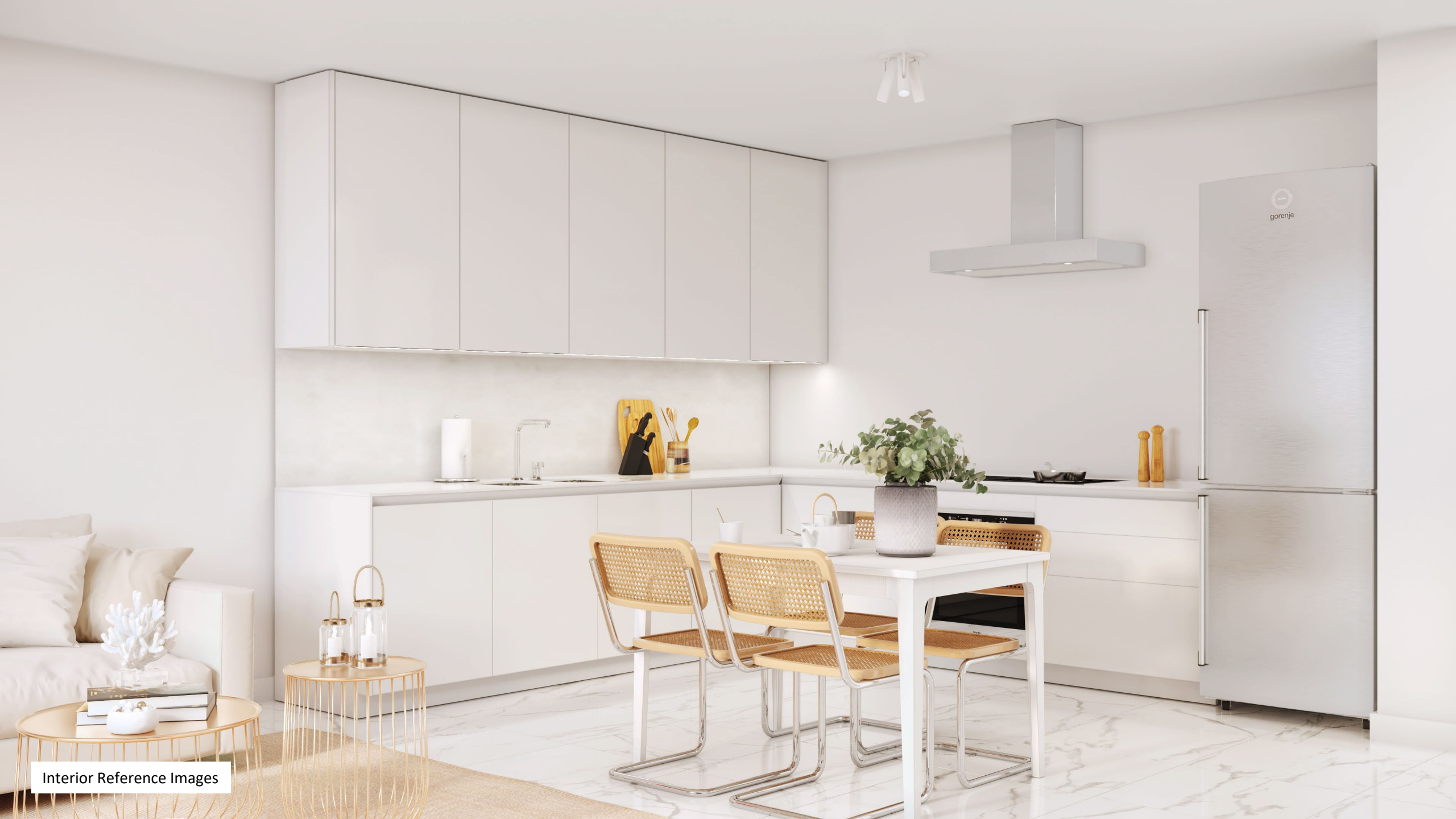
Interior Reference Images